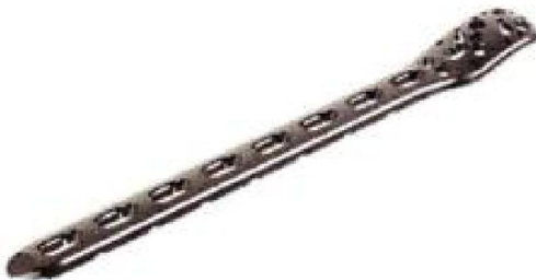
Proximal Humeral Locking Plate- II