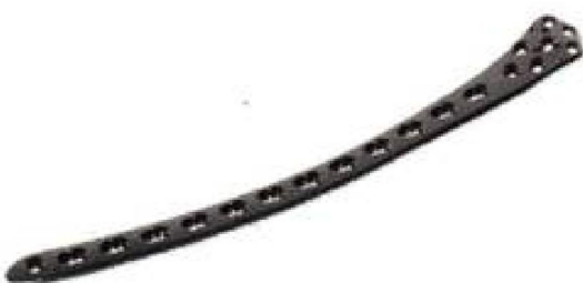
Distal Lateral Femoral Locking Plate