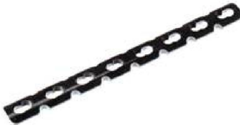
3.5mm Reconstruction Locking Plate, straight