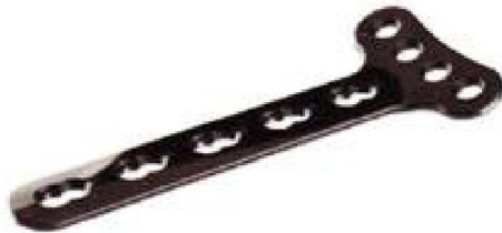
3.5mm LCP T-Plate, right-angled (head 4 holes)