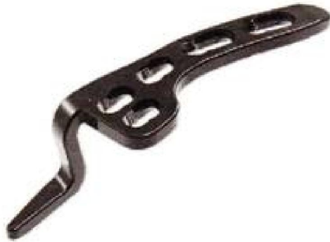
Sternoclavicular Hook Plate 15mm