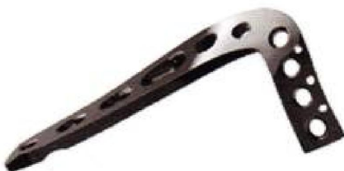
Distal Lateral Tibial Locking Plate