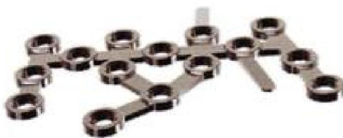
Calcaneal Locking Plate