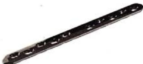
4.5mm LCP Plate, with LC-undercuts, broad