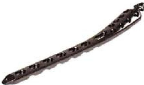
3.5mm LCP Distal Medial Tibial Plate